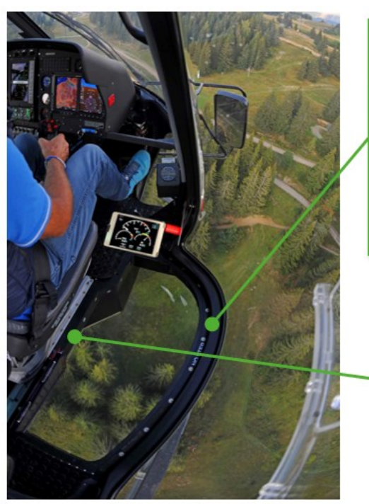
Helicopter with Maximum Pilot View Kit