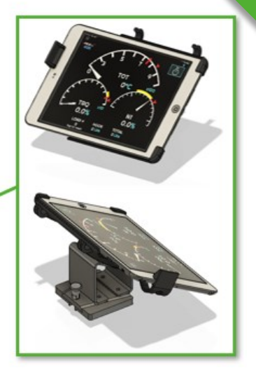
AS350 B3 (H125) FLI repeater devices mounts