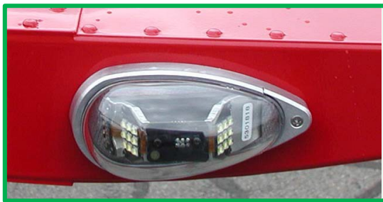
Option B: WHELEN LED lights