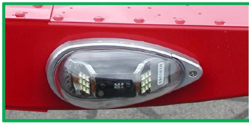
Option A: AVEO ENGINEERING LED lights