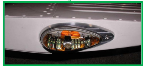
Option B: WHELEN LED lights