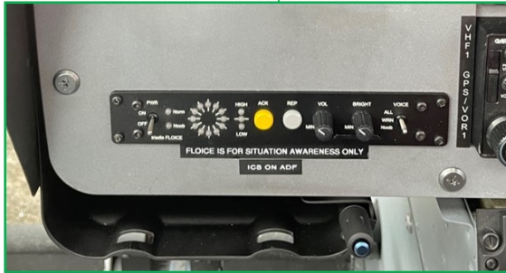
OPTION2: Instrument Panel